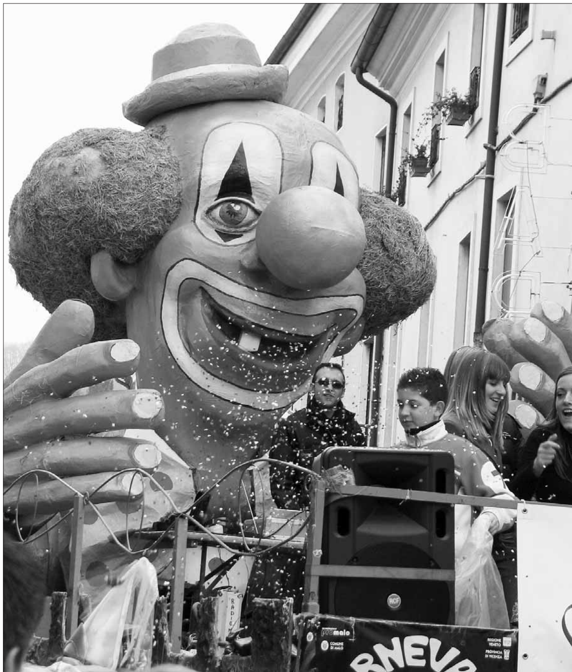
Children throw confetti from one of the floats during a past parade held in Malo. The float is the one starting the parade with Ciacci, the clown, which is the symbol of the Carnival of the town since 1974. The first official parade took place in 1924 with a contest of the participating floats. This year, Malo will hold three parades: the first on Sunday, the second the following Sunday Feb. 3 and the last one will take place on Mardi Gras, Feb. 5. All of them will start at 2 p.m.

The exhibition is divided into five sections: Gold of the steppes; Genghis Khan and the conquests of the Mongol Empire; the voyage of Marco Polo and the triumph of the Silk Road; the mysteries of the dynasties beyond the Great Wall and the last section, the most beautiful porcelain of all time. Open until May 4 on Tuesday, Wednesday, Thursday 9 a.m.-7 p.m.; Friday, Saturday, Sunday 9 a.m.-8 p.m., closed Monday. Entrance fee 9 euro.